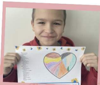
COLOR YOUR HEART